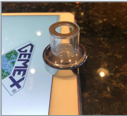
3. Place iLoupe over locating ring