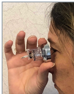
Use your eye to view the diamond