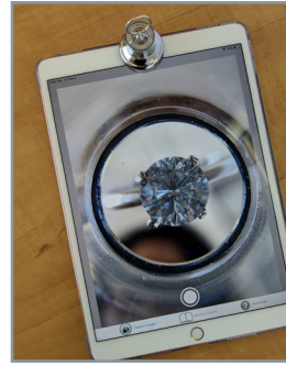
iLoupe app screen