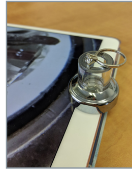
Diamond girdle placement side view