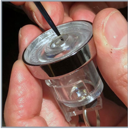
1. Removing locator ring