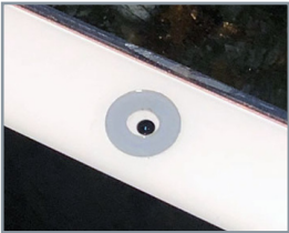
2. Center ring over camera lens