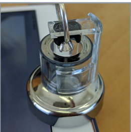
*Ring on glass with clip