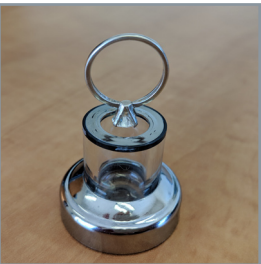
4. Ring on glass without clip