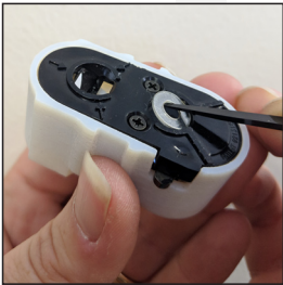
1. Removing locator ring