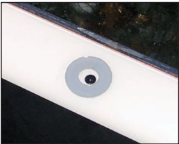
2. Center ring over camera lens