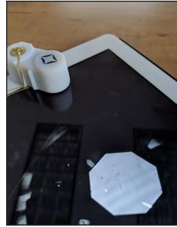
1. Forevermark App