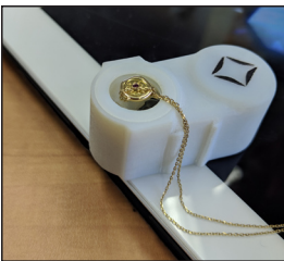
4. Place viewer over locating ring 5. Place jewelry on glass