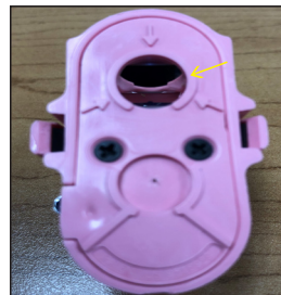
2. Lens on bottom of viewer