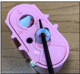
2. Remove locator ring