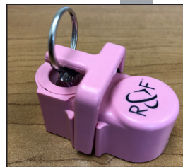
1. Place clip over jewelry