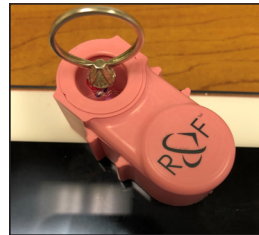
4. Center opening on locator ring