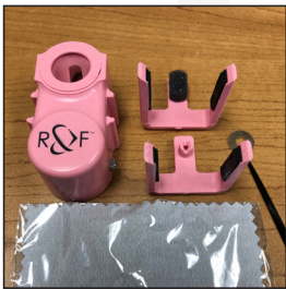
1. R&F viewer kit